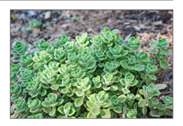
Mexican Mint