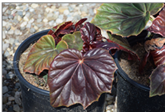
Red Fred Begonia foliage

Red Fred Begonia is recommended for the following landscape applications;