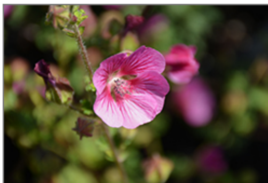
Elegans Princess Cape Mallow flowers