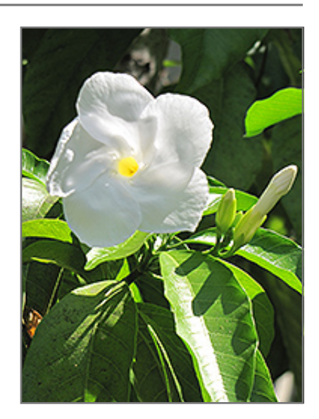
Lateira flowers