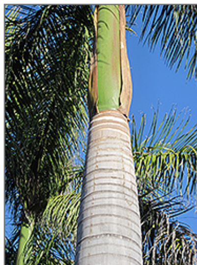
Florida Royal Palm bark

This plant is not reliably hardy in our region, and certain restrictions may apply; contact the store for more information.