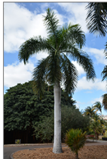
Florida Royal Palm

Florida Royal Palm is an open evergreen tree with a strong central leader and a towering form, with a high canopy of foliage concentrated at the top of the plant. Its average texture blends into the landscape, but can be balanced by one or two finer or coarser trees or shrubs for an effective composition.