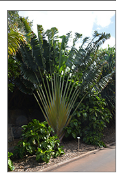
Orange Traveller's Palm

Orange Traveller's Palm will grow to be about 20 feet tall at maturity, with a spread of 15 feet. It has a high canopy with a typical clearance of 5 feet from the ground, and is suitable for planting under power lines. It grows at a slow rate, and under ideal conditions can be expected to live for 50 years or more.