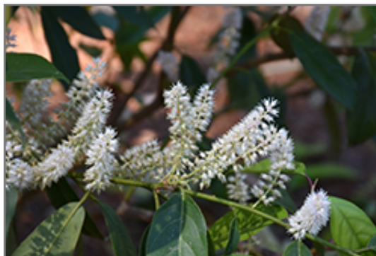
Chinese Sweetspire flowers