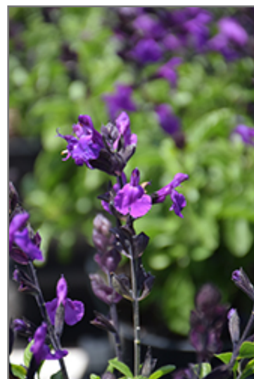
Mirage Violet Autumn Sage flowers

Mirage Violet Autumn Sage is recommended for the following landscape applications;