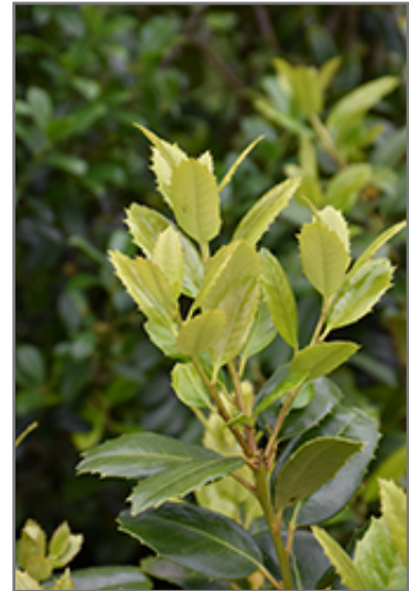
Auburn Lusterleaf Holly foliage