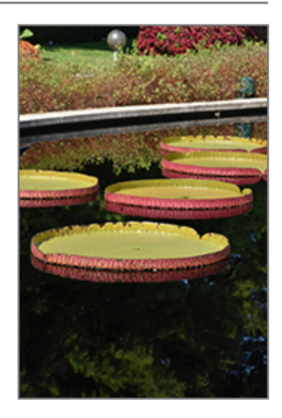
Santa Cruz Tropical Water Lily