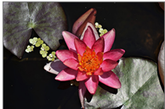
Sultan Hardy Water Lily flowers