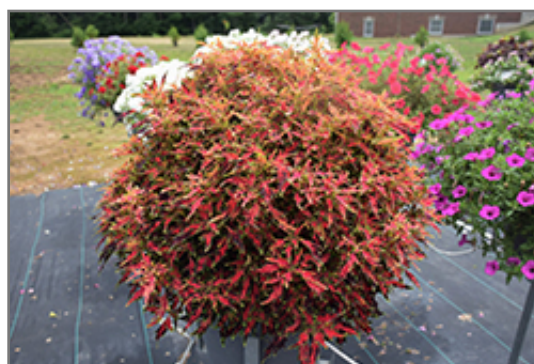
ColorBlaze Mini Me Watermelon Coleus