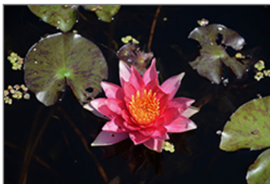
Robinsoniana Hardy Water Lily flowers