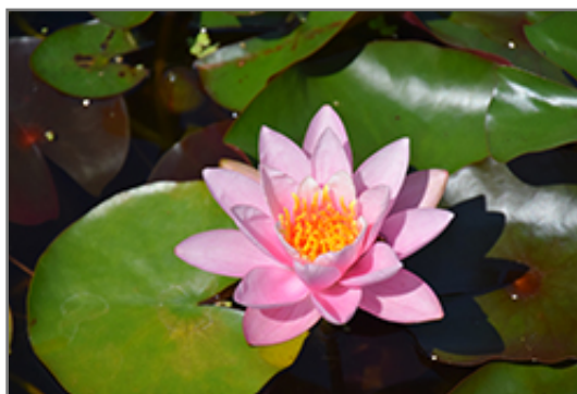
Norma Gedye Hardy Water Lily flowers