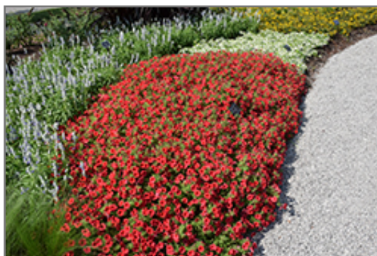
Supertunia Mini Vista Scarlet Petunia in bloom