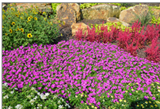
Supertunia Mini Vista Sweet Sangria Petunia in bloom

Supertunia Mini Vista Sweet Sangria Petunia will grow to be about 8 inches tall at maturity, with a spread of 24 inches. When grown in masses or used as a bedding plant, individual plants should be spaced approximately 20 inches apart. Its foliage tends to remain low and dense right to the ground. This fast-growing annual will normally live for one full growing season, needing replacement the following year.