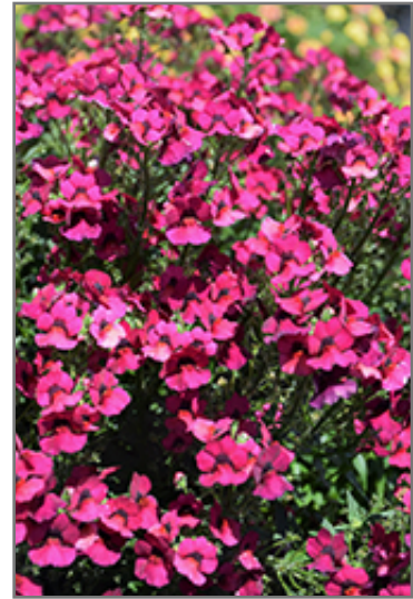
Nesia Magenta Nemesis flowers