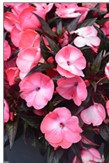
Infinity Salmon New Guinea Impatiens flowers

Infinity Salmon New Guinea Impatiens is recommended for the following landscape applications;