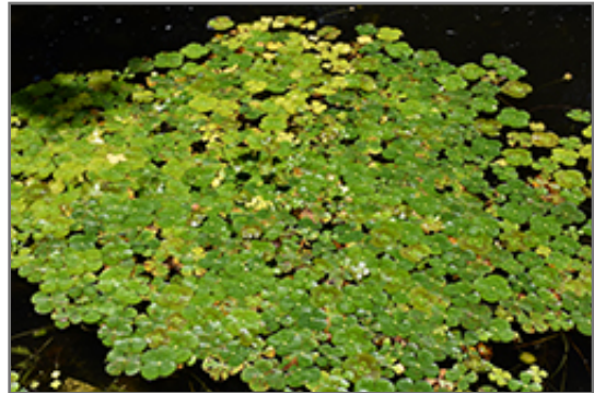
Four Leaf Water Clover