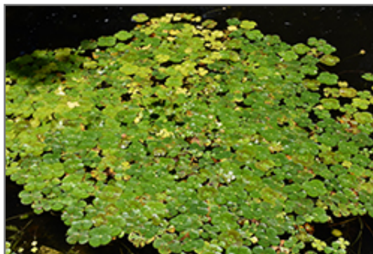
Four Leaf Water Clover