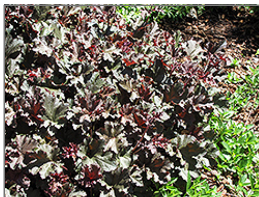
Purple Petticoats Coral Bells