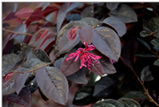
Carolina Midnight Chinese Fringeflower flowers