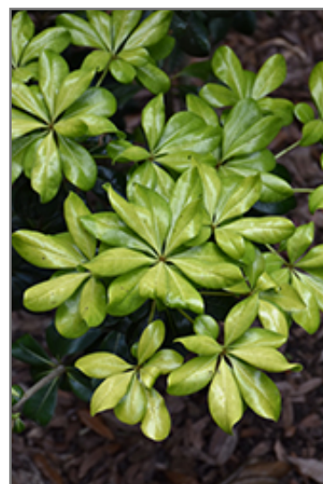
Spring Bouquet Mock Orange foliage