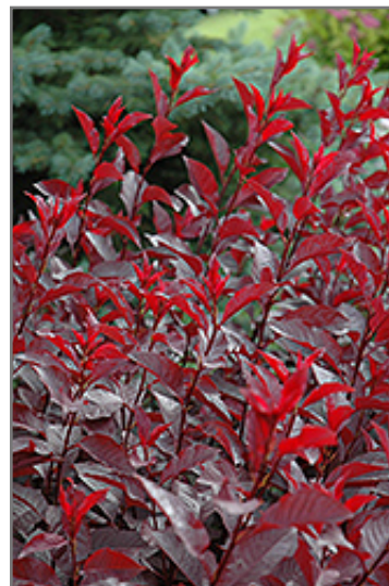
Purpleleaf Sandcherry foliage