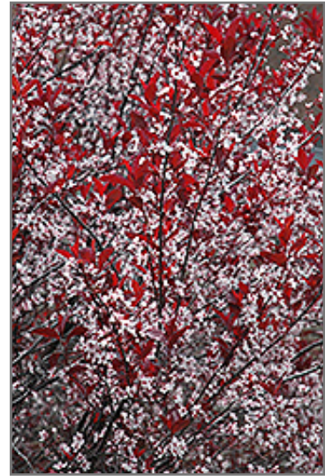
Purpleleaf Sandcherry flowers

This plant is not reliably hardy in our region, and certain restrictions may apply; contact the store for more information.