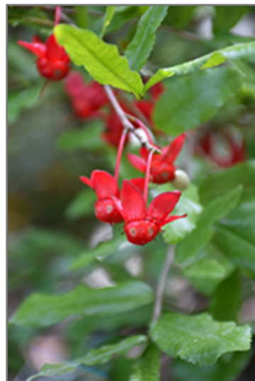
Mickey Mouse Plant flowers

This is a relatively low maintenance shrub, and should only be pruned after flowering to avoid removing any of the current season's flowers. It is a good choice for attracting birds, bees and butterflies to your yard, but is not particularly attractive to deer who tend to leave it alone in favor of tastier treats. Gardeners should be aware of the following characteristic(s) that may warrant special consideration;