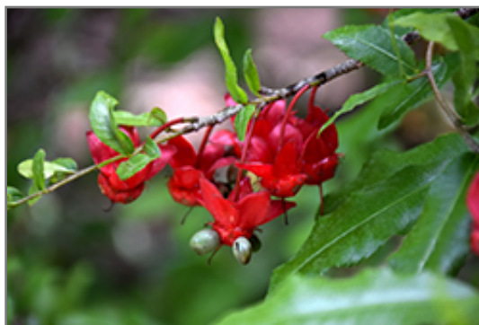
Mickey Mouse Plant flowers