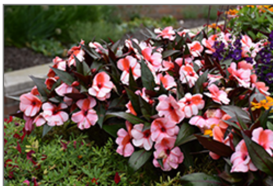
Clockwork Orange Stripe New Guinea Impatiens in bloom