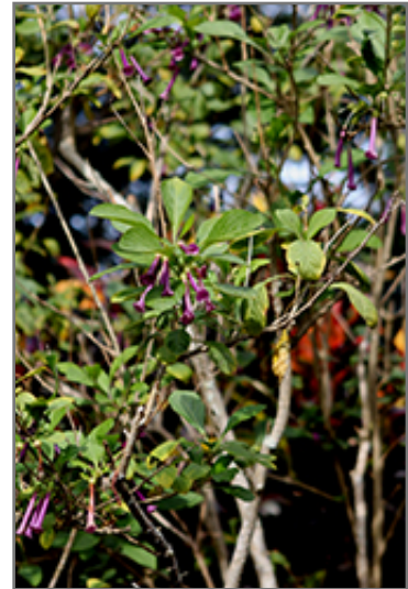
Purple Tube Flower flowers