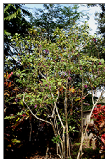
Purple Tube Flower in bloom