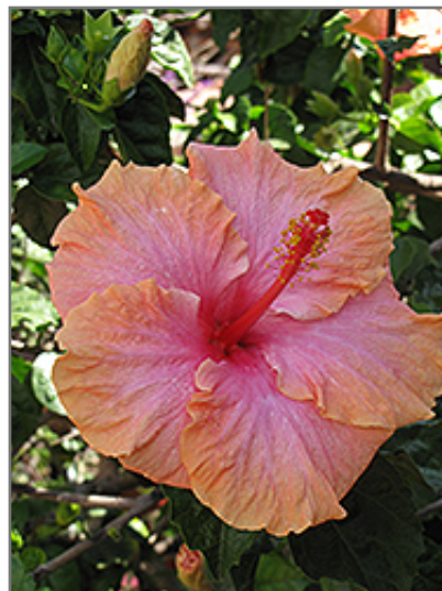
Ross Estey Hibiscus flowers

This plant does best in full sun to partial shade. It requires an evenly moist well-drained soil for optimal growth, but will die in standing water. To help this plant achieve its best flowering performance, periodically apply a flower-boosting fertilizer from early spring through into the active growing season. It is not particular as to soil pH, but grows best in rich soils. It is highly tolerant of urban pollution and will even thrive in inner city environments. Consider applying a thick mulch around the root zone in winter to protect it in exposed locations or colder microclimates. This is a selected variety of a species not originally from North America. It can be propagated by cuttings; however, as a cultivated variety, be aware that it may be subject to certain restrictions or prohibitions on propagation.