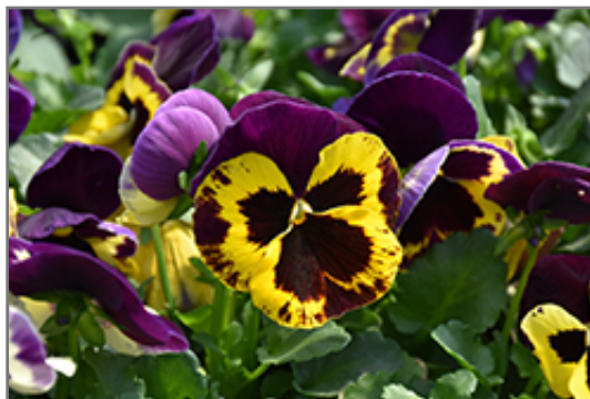
Delta Speedy Yellow and Purple Pansy flowers