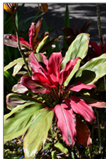
Sunset Hawaiian Ti Plant