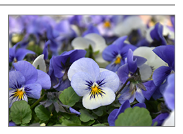
Sorbet XP YTT Pansy flowers