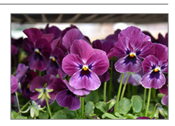
Sorbet XP Raspberry Pansy flowers