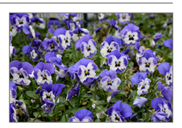
Sorbet XP Delft Blue Pansy flowers