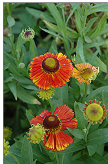
Sahin's Early Flowerer Sneezeweed flowers