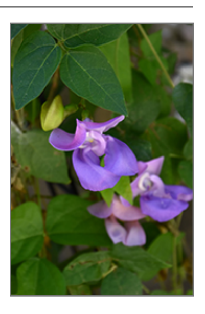
Corkscrew Vine flowers