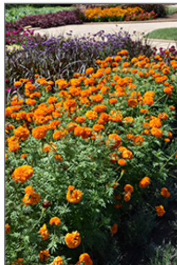
Xochi Orange Marigold in bloom