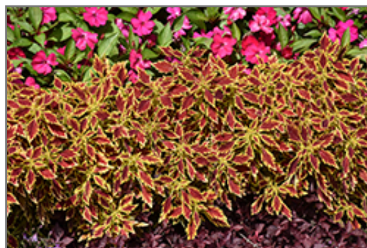
FlameThrower Serrano Coleus