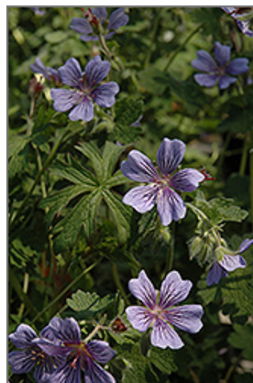
Brookside Cranesbill flowers

Brookside Cranesbill is recommended for the following landscape applications;