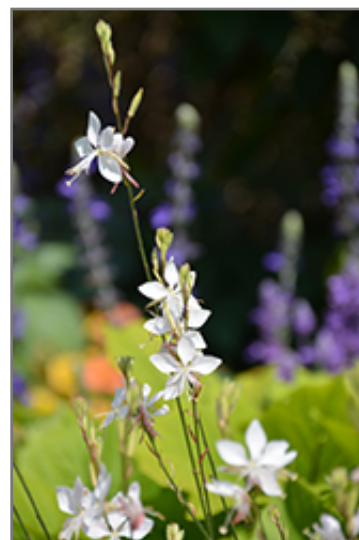
Stratosphere White Gaura flowers

Stratosphere White Gaura is recommended for the following landscape applications;