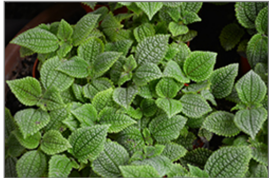
Moon Valley Pilea foliage