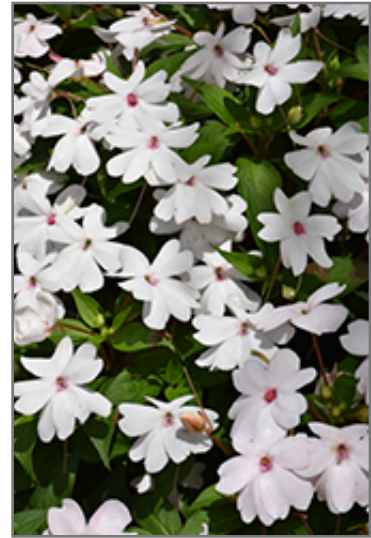
Solarscape White Shimmer Impatiens flowers

Solarscape White Shimmer Impatiens is recommended for the following landscape applications;