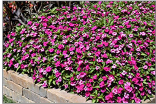
Solarscape Neon Purple Impatiens in bloom

Solarscape Neon Purple Impatiens will grow to be about 9 inches tall at maturity, with a spread of 20 inches. When grown in masses or used as a bedding plant, individual plants should be spaced approximately 14 inches apart. Its foliage tends to remain low and dense right to the ground. This fast-growing annual will normally live for one full growing season, needing replacement the following year.