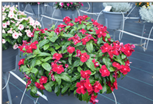
Titan Cranberry Vinca in bloom

Titan Cranberry Vinca will grow to be about 14 inches tall at maturity, with a spread of 12 inches. Its foliage tends to remain dense right to the ground, not requiring facer plants in front. Although it's not a true annual, this fast-growing plant can be expected to behave as an annual in our climate if left outdoors over the winter, usually needing replacement the following year. As such, gardeners should take into consideration that it will perform differently than it would in its native habitat.