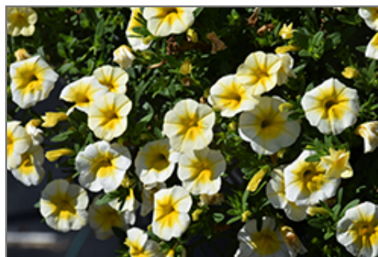
MiniFamous Uno White Gold Calibrachoa flowers