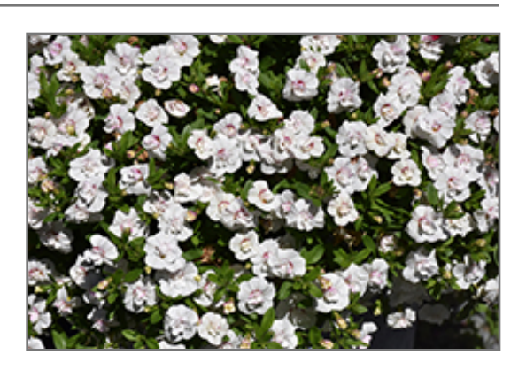
MiniFamous Uno Double White + Pink Whirl Calibrachoa flowers

MiniFamous Uno Double White + Pink Whirl Calibrachoa is recommended for the following landscape applications;