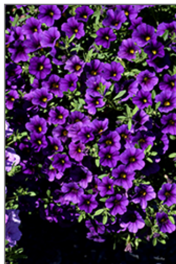
MiniFamous Neo Dark Blue Calibrachoa flowers

An early flowering and uniform trailing series presenting boldly colored blooms, cascading from small, green foliage; a stellar performer with a summer-long display of color in hanging baskets and combination planters