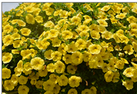
Cha-Cha Yellow Calibrachoa flowers