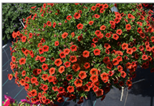
Cha-Cha Orange Calibrachoa in bloom