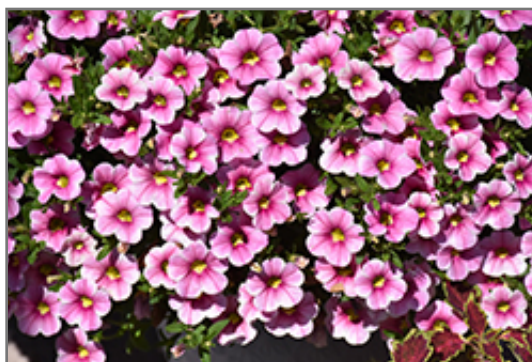
Cabaret Strawberry Parfait Calibrachoa flowers

Cabaret Strawberry Parfait Calibrachoa is recommended for the following landscape applications;