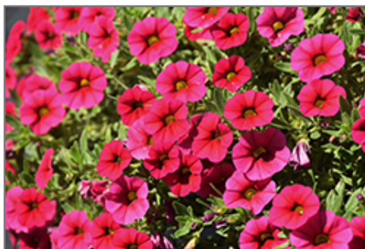
Cabaret Hot Rose Calibrachoa flowers