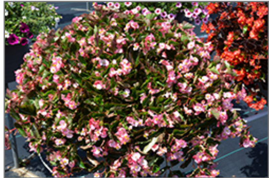
Hula Pink Begonia in bloom

Hula Pink Begonia is a fine choice for the garden, but it is also a good selection for planting in outdoor containers and hanging baskets. Because of its spreading habit of growth, it is ideally suited for use as a 'spiller' in the 'spiller-thriller-filler' container combination; plant it near the edges where it can spill gracefully over the pot. Note that when growing plants in outdoor containers and baskets, they may require more frequent waterings than they would in the yard or garden.